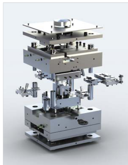
This moldbase was developed with PTC Creo Expert Moldbase Extension and rendered in PTC Creo Parametric™.